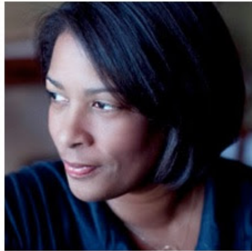
Left: Sexy Beast host Andy Richter. Right: Dawn Porter, 2016 Sexy Beast Honoree.

Hollywood entertainment and the Los Angeles art world will come together again this September 10 for the second edition of Sexy Beast , an evening of performance and art auction benefiting Planned Parenthood Los Angeles (PPLA) at The Theatre at Ace Hotel, Downtown Los Angeles.